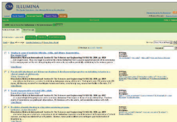
Subject feed to major bibliographic databases

This unique service enables universities to publish, archive and disseminate their graduate research within a secure and managed environment. Copies of the documents are kept in both digital and microform formats, which are stored within climate and humidity controlled vaults. Retrospective digitisation is also possible to create a comprehensive collection of scholarly works that is easily accessible to researchers anywhere in the world.